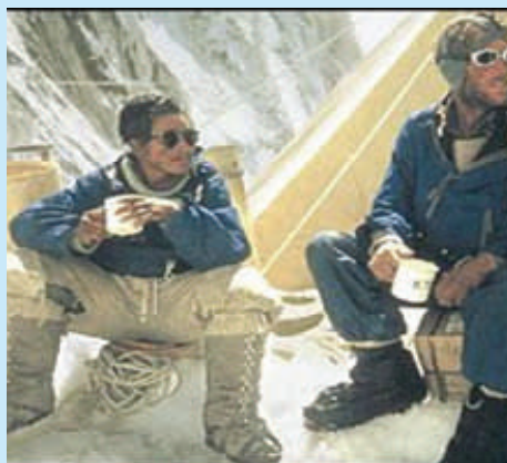
Sherpa Tenzing Norgay and Sir Edmund Hillary

Sir Edmund Hillary passed away on January 11, 2008, aged 88. The world knew him as the legendary mountaineer who conquered Mount Everest accompanied by his guide, Sherpa Tenzing Norgay on May 29, 1953. A modest person that he was, he never revealed who reached the summit first, until Tenzing passed away in 1986.